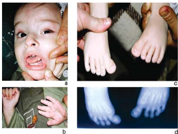
Figure 1. Patient 1: (a) notched upper lip, small teeth, tongue nodules and hamartoma; (b) broad first toes bilaterally; (c) minor skeletal changes of the feet.

On examination, the patient was 81 cm long and weighted 10 kg. He had a notch at the upper lip, highly arched palate, multiple frenulae, small teeth, multiple nodules on the tongue and an infralingual hamartoma. His facial appearance was characterized by frontal bossing, telecanthus, hypertelorism, deep-set eyes, and mild micrognathia. He had permanent rotatory nystagmus and ceaseless eyelid movement. Both hands showed minor postaxial polydactyly, with no involvement of skeletal structures. X-Ray examination of the hands showed slight widening of the terminal phalanges of both thumbs and dysplastic, broad and short intermediate phalanges of all fingers. The nails were short and broad. X-Ray examination of the feet showed varus deformity, bifid terminal phalanges of the hallux and hypoplastic