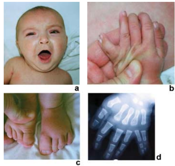
Figure 3. Patient 3: (a) facial features of the infant; (b) postaxial polydactyly of the left hand; (c) mesoaxial poly-syndactyly on the feet

Patient 4. The newborn with phenotypically ambiguous genitalia, was referred to the hospital because of respiratory distress syndrome and the presence of multiple anomalies. The family history was unremarkable. The parents were young and not related, of Gypsy origin, and had a healthy girl previously. The second pregnancy was complicated by