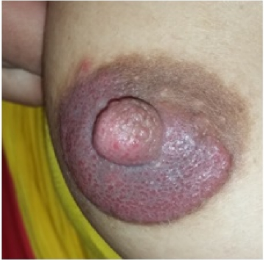
FIGURE 1: Patient's breast manifestations (areola hyperkeratosis and discharge)

yeast infection and was treated with miconazole vaginal cream.