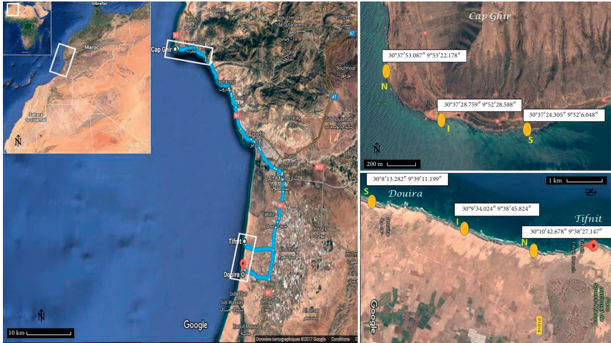
FIGURE 1: Map of the sampled sites in the coastline: Cap Ghir in the north and Tifnit-Douira in the south of Agadir (Morocco) (South (S), Instal (I), and North (N)), and the distance between the sites is >1 km.

A comparison between the sites for the same seasons did not show any significant difference, during the two years, excluding the Instal site during spring 2016.