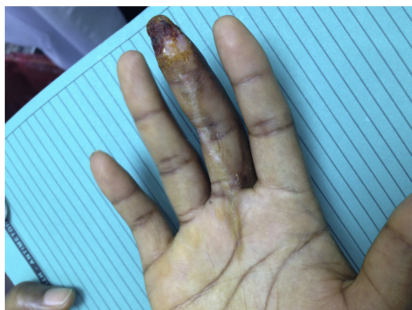
FIG. 2. Palmar view of middle finger. No signs of infection are observed. Superficial pulp skin necrosis and slight stiffness of proximal interphalangeal joint can be seen.

Erysipelothrix rhusiopathiae was first isolated in 1876 by Koch [1] in a mouse. Not until 1884 did Rosenbach establish it as a human pathogen. It is considered to be a Gram-positive,