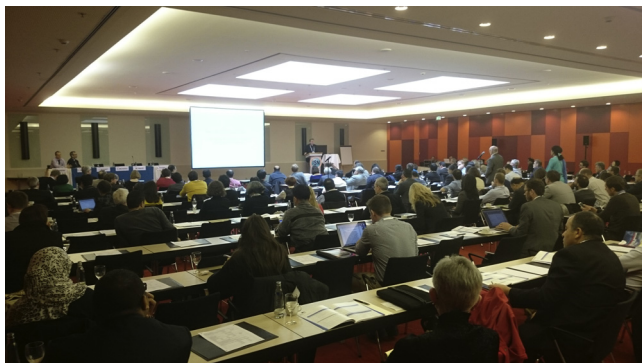
Figure 1. International Society of Nephrology Nexus 2016 Berlin Symposia: Translational Immunology in Kidney Disease, 14–17 April 2016, Germany.

unlimited access to RRT, the majority of renal care providers are engaged in RRT, which together with the renal replacement industry has shifted academic research activities away from CKD prevention. Although programs in CKD/ESRD prevention are likely to be highly cost-effective for national health care systems all over the world, minimal coordinated efforts are made by public bodies, academia, industry, and society. The reasons for this lack of awareness at all levels are the asymptomatic nature of CKD, a generalized complacency because we have RRT and can often avoid death from renal failure, and the financial incentives of providing RRT. Although RRT catapulted nephrology to among the most attractive medical specialties some decades ago, the situation has dramatically changed in the recent years. The development of innovative drugs that promise cures for disease is currently revolutionizing many other medical specialties such as oncology, dermatology, and rheumatology, thereby attracting the attention of pharmaceutical companies, physicians in training, and medical students. Indeed, nephrology is no longer considered an attractive career option among medical residents. 7,8