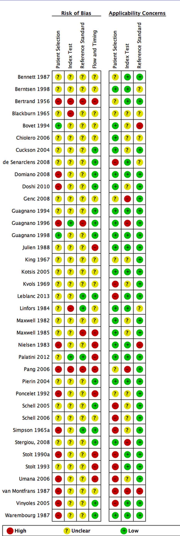
Figure 2 Risk of bias and applicability concerns summary with review authors' judgements for each included study.

measurement in obesity yielding a pooled sensitivity of 0.87 (0.79 to 0.93) and a specificity of 0.85 (0.64 to 0.95). Service 29 32-34 Only three studies were inside the 95% CIs for the summary receiver operating curve (SROC) summary point. The five outlying studies had a relatively small sample size (5–20 participants). Deeks funnel plot asymmetry test had a non-significant p value (p=0.53) for the slope coefficient suggesting no evidence of publication bias. Only one study was included for the subgroup analysis of those patients with BMI>35. This resulted in a sensitivity of 0.88 (0.47 to 1.00) and a specificity of 0.71 (0.40 to 0.90). There were insufficient data to perform any other subgroup analyses. Across the six studies there was no difference in reference threshold and all avoided verification bias.