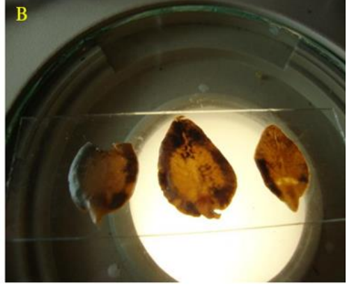
Fig. 1: ERCP image showed a radiolucent, crescent- like shadow in the CBC (white arrows) (A), adult Fasciola hepatica flukes measuring 1.5-2 cm×1 cm in diameter isolated from patients (B)