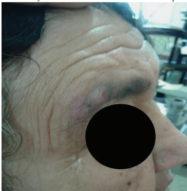
Fig. 1. External eye examination showed the site of scorpion bite had redness and swelling.

room of our ophthalmology center with the chief complaint of abrupt vision loss and periorbital edema in her right eye. The patient reported that she was stung by a scorpion on her right eyebrow 2 days prior to admission and she had not received anti-venom. The patient brought the dead scorpion picture, and the species was confirmed by an entomologist as yellow scorpion ( Mesobuthus Eupeus ). The patient reported that she had not referred to the treatment center during the scorpion bite and had not presented with systematic symptoms; she also had not received an anti-venom. At emergency admission, the patient's vital signs were within normal range (BP:130/70mmHg, HR: 78bpm in the sinus rhythm, RR: 21 bpm, T:37.1°C oral temperature). The patient had no past history of systemic diseases such as hypertension, diabetes and coagulative disorders. External eye examination showed the site of scorpion