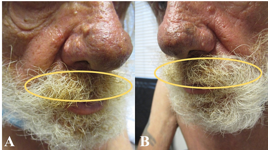
FIGURE 3: Prominent xanthochromia as the presenting feature of smoker's mustache

In addition, an examination of his hair and nails was performed. His face showed yellow discoloration of the mustache hair in the central area (Figure 3). Also, there was brown discoloration of the distal third digit, at the distal amputated tip, on his left hand. The nails on the index finger and ring finger of his right hand and the index finger of his left hand also showed brown discoloration (Figure 4).