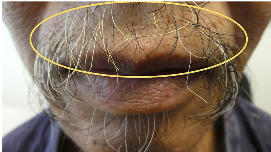
FIGURE 1: Smoker's mustache presenting as yellow hair discoloration on the upper lip

Acquired yellow hair in the central mustache on the upper lip of a 54-year-old Asian man (yellow oval).