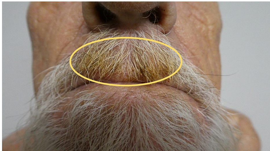
FIGURE 5: Smoker's mustache manifested by xanthochromia of the hair on the upper lip of a 71-year-old Caucasian man

The yellow discoloration is most noticeable on the central mustache hairs (yellow oval).