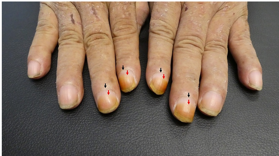
FIGURE 2: Cigarette smoking-associated harlequin nails

Acquired yellow hair in the central mustache on the upper lip of a 54-year-old Asian man (yellow oval).