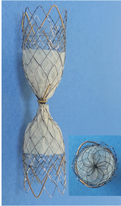
Fig. 1. A specially designed ureteral occlusion stent having candy-wrapper configuration. The middle of the stent was completely constricted in order to allow waterproofing.

The occlusion stent was made of nickel/titanium alloy, and