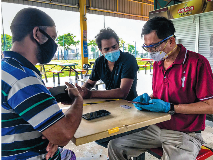
Photo: HealthServe staff providing psychosocial assistance to workers in a gazetted dormitory and enabling connectivity via smartphone (from the authors’ collection, used with permission).