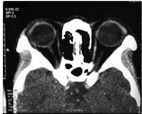
Figure 4: Postoperative computed tomography-scan of the orbit

In this case, the patient did not have typical clinical features of a lacrimal gland malignancy. Usually, malignant lesions of the lacrimal gland are characterized by a rapid growth in <6 months, ptosis, ocular motility disturbances, diplopia, and bone erosion on radiographs. [1] The presence of pain in malignant tumors is another characteristic feature. [2,6,7] Her CT orbit had shown a well-defined regular homogenous enhancement of lacrimal gland mass but with no radiological features of malignancy. In this case, HPE played a very important role to make the precise diagnosis. Immunohistochemistry has been successfully utilized in the diagnosis of many adnexal tumors. However, since, primary ductal adenocarcinoma of the lacrimal gland is very rare, only a few markers have been reported. These include