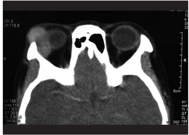
Figure 2: Computed tomography-scan showing the lacrimal gland tumor