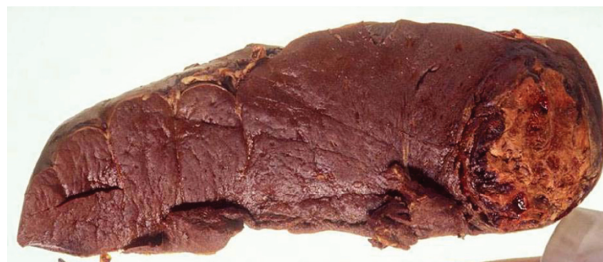
Figure 2 Gaucher spleen >3 kg with large recent infarct.

It is noteworthy that in the past, type I Gaucher disease was defined as being free of neurological manifestations,