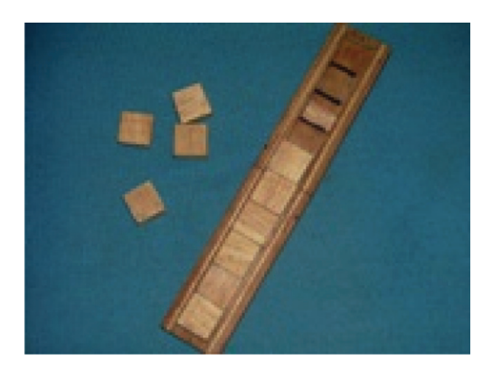
Fig. 1. Wooden visual analogue scale.

All instruments were included in two versions of a single questionnaire. Both questionnaires started with the SRH question. Next, half of the questionnaires had a drawn VAS followed a wooden VAS, and the other half had a wooden VAS followed by a drawn VAS. This was done to control for the potential effect of one VAS on the other.