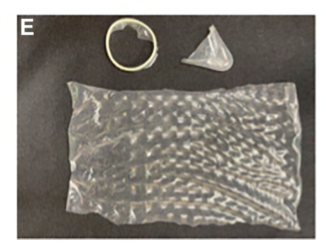
Fig. 2. Creating a dental dam from a male condom.

based on the current literature<sup>11</sup>; this may be accounted for by factors, such as a paucity of data, infrequent use due to sparse patient education, perceived barriers to procurement and accessibility, and unfamiliarity on the part of providers. Condoms have repeatedly been shown to decrease STI risk; it is likely that dental dams will decrease risk as well when extrapolating the aforementioned data on condoms. Yet, there is a clear need for more provisional research on dental dams to ascertain their usage, perceived barriers, and efficacy in STI prevention.