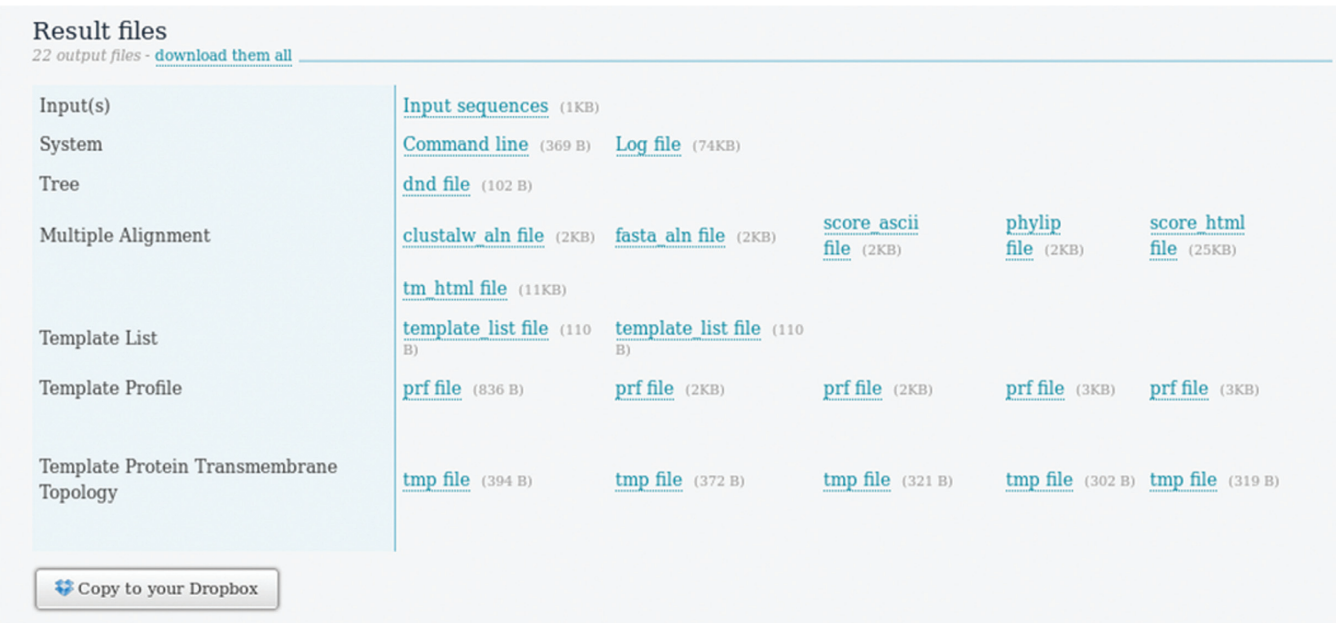
Figure 1. (A) The graphical MSA output coloured according to transmembrane topology prediction where yellow residues are predicted to be in the inner loop, red in the transmembrane helix and blue in the outer loop. (B) 3D structure of PDB ID: 2ZIY with the HMMTOP predicted transmembrane topology colouring. (C) The raw result files.