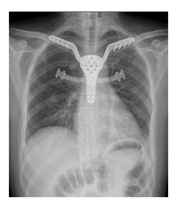
Figure 4 Postoperative chest radiographs showed that the metal graft was in a normal position.

Radiological examination has great clinical value for the early discovery of ETE. The CT image of osseous EHE presents a multifocal lytic abnormality with osseous expansion, sclerotic margins, and a lack of periostitis. However, the diagnosis of EHE needs to be confirmed by pathology and immunohistochemistry. Pathologically, the tumor is composed of dendritic and endothelial cells with positive nuclear staining, and positive immunohistochemistry for vascular markers (CD31, CD34, and vimentin) can show better specificity. In addition, the WWTR1-CAMTA1 characteristic fusion gene is regarded as an auxiliary diagnosis. The main differential diagnosis of EHE includes metastatic signet-ring cell adenocarcinoma and epithelioid angiosarcoma.<sup>4</sup>