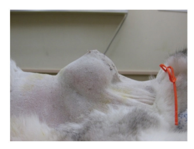
Figure 1. Tumor of a typical case of feline vaccine-associated sarcoma (case 1). Tumor is located at the interscapulum (4.5x4.0 cm; Right, cranial).

PHCT. The PHCT procedure was performed as previously reported (15) under general anesthesia with isoflulene (DS Pharma Animal Health Co., Ltd., Osaka, Japan). In brief, ICG (25 mg/vial; Giagnogreen; Daiich Sankyo Co. Ltd, Tokyo, Japan) was dissolved in 9 ml saline (Otsuka Pharmacy, Co., Ltd., Tokyo, Japan) with an adjusted pH of 5.0. Anticancer drugs, including 1 ml carboplatin (50 mg/5 ml; Nippon Kayaku Co. Ltd, Tokyo, Japan) and 0.1 ml paclitaxel (300 mg/5 ml; Nippon Kayaku Co., Ltd). Tissue necrosis was observed in case 1 due to the paclitaxel treatment; as such, the volume of paclitaxel was reduced to 0.01-0.02 ml paclitaxel (30 mg/5 ml) in subsequent procedures. The solution was prewarmed at 45°C. A broadband light source (Super Lizer 5000; Tokyo Iken Co., Ltd, Tokyo, Japan), emitting a wavelength spectrum from 600 to 1,600 nm with a 5,000 mW maximum output power, was used. For each case, the tumors were resected and the ICG solution was injected into the resected area 3-dimensionally, including the skin surgical margin (2-3 cm), at a concentration of 1 ml per cm<sup>3</sup> of the wound bed. Irradiation was applied at a distance of 10 cm from the resected area (irradiation area: 113 cm<sup>2</sup>, 40 mW/cm<sup>2</sup>) for 20 min per 113 cm<sup>2</sup> (48 J/cm<sup>2</sup>) immediately following injection of the ICG solution, under general anesthesia with isoflulene. A representative image (Case 2) of the surgical procedure is shown in Fig. 4. The temperature at