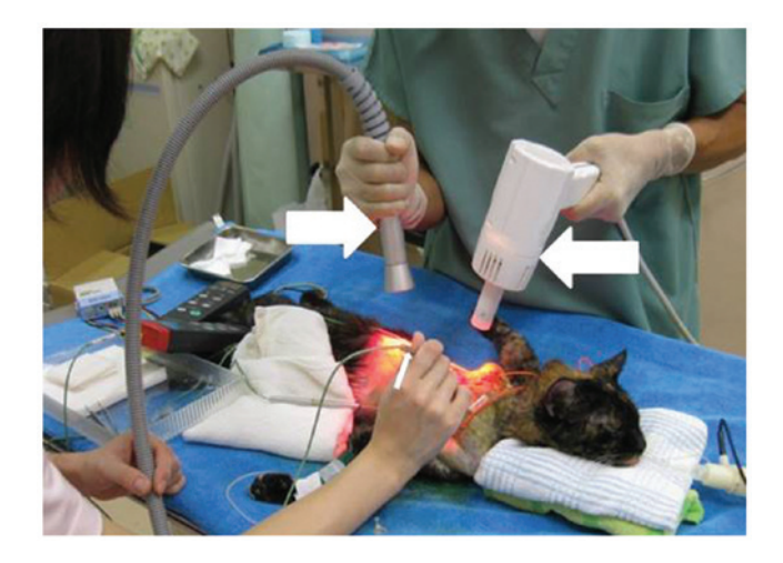
Figure 4. Typical image of the PHCT procedure (Case 2). PHCT was performed following surgery. Big arrows, the broadband lightsource; thin arrow, thermometer.

site; in addition, the interstitial temperature was maintained at 39.5-42.5°C.