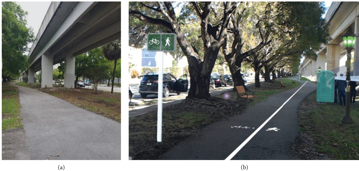
FIGURE 2: Environment not including (a) and including (b) the augmented reality displays of (from right to left) a transparent wall, light fixtures, bathroom, lane separations for bikes and pedestrians, benches, and signage.