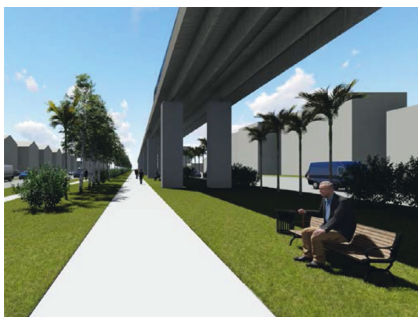
FIGURE 3: Fully immersive virtual reality environment used for balance testing.

AR and no glasses/goggles. The computer scientists who are part of the team and co-authors designed, produced, and coded the AR and VR environments.