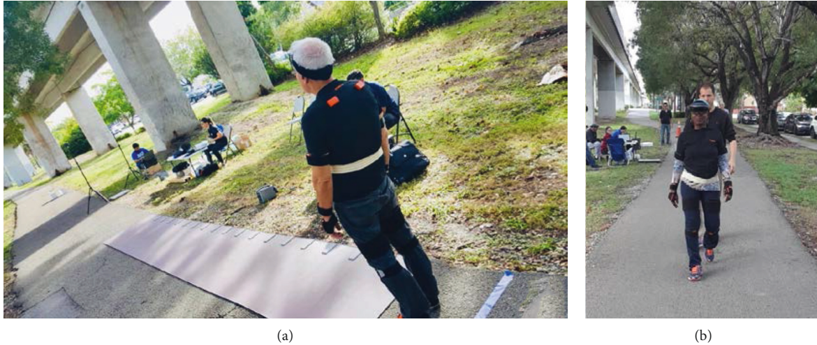
FIGURE 1: Participant at the beginning of the mat before initiating a walking trial (a) and a participant finishing the walk after crossing the mat (b).