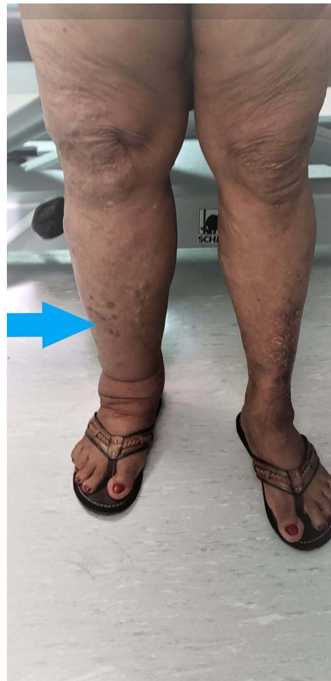
Figure 4 Hemi-hypertrophy of right lower limb (blue arrow) in patient with Klippel-Trénaunay syndrome.

existed, which could be part of a spectrum of disorders. 23 However, KTS is a sporadic disease almost all of the time with no distinct family history, and it arises from non-inherited gene mutations, which are not germline, but somatic mutations. 14,20,24,25 They are known to arise in cells in the embryonic stage prior to birth, and as development continues, cell proliferation occurs. Those cells arising from that original mutated cell, will carry the disease (the mutation), but the other cells do not carry this abnormality. This is referred to as mosaicism, where there is a mingling of cells, with and without mutation. 26