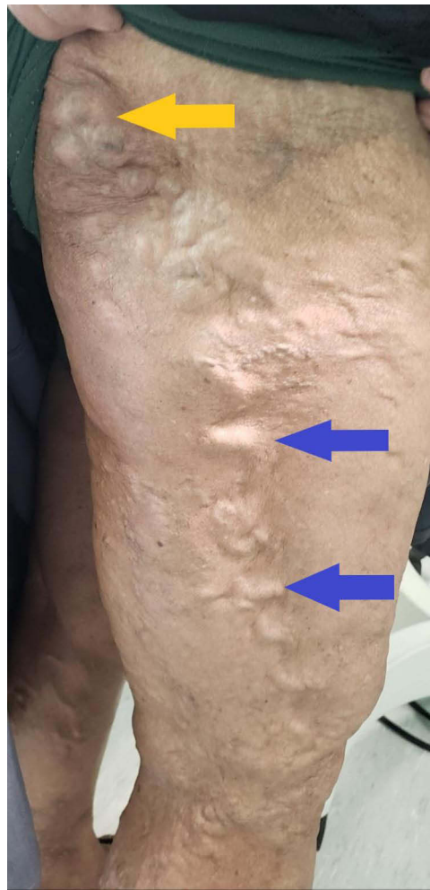
Figure 2 Lateral marginal vein (blue arrows) and gluteal vein (yellow arrow) seen in patient with Klippel-Trénaunay syndrome. The lateral marginal vein is considered pathognomonic of the disease.

some degree of heterogeneity in its genetic constitution. Investigations showed that at the breakpoint of the chromosome (11p15.1), there was a promoter region of a novel Vascular Gene on 5q initially named VG5Q . This vascular gene was then formally named AGGFI [Angiogenic Growth Factor 1], a potent angiogenesis factor lying in the domain of the vascular endothelial growth factors (VEGFs-A to F). VEGFA was already known to be an early embryonic marker for vasculature formation. 15,21,22 Identification was therefore made of a susceptibility gene which, when mutated, caused a predilection to Klippel-Trenaunay Syndrome. 15 This gene was identified in 5 of 130 patients with KTS (but not in 200 control patients). It was thought to be of great significance, since a genetic component was finally identified. 15 This was important in the context of the many malformation syndromes that have a vascular component at the forefront of their clinical presentations, such as KTS, Parkes Weber Syndrome (PWS) and the Servelle Matorell Syndrome.