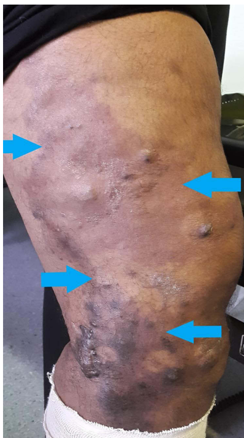
Figure 1 Cutaneous haemangioma seen on left thigh of a patient with Klippel-Trénaunay syndrome (limit of edges outlined by blue arrows).

varicosities, but many other anomalies may exist, such as compressive fibrous bands, aneurysmal dilatation, duplication, hypoplasia, atresia and aplasia. 5–7 Due to venous stasis in these large valveless veins, deep vein thrombosis (DVT) and associated pulmonary embolism are well known complications of KTS.