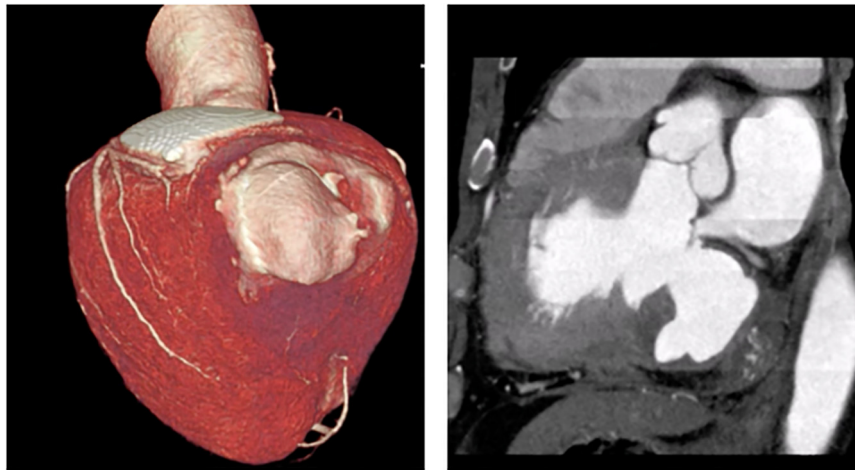
FIGURE 1. A preoperative contrast enhanced computed tomography image. A pseudoaneurysm was found in the in the posterior wall of the left ventricle.