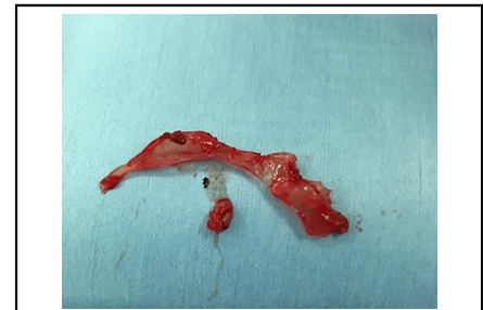
The removed fibrin mass from the left ventricular cavity.

https://doi.org/10.1016/j.xjtc.2022.09.011