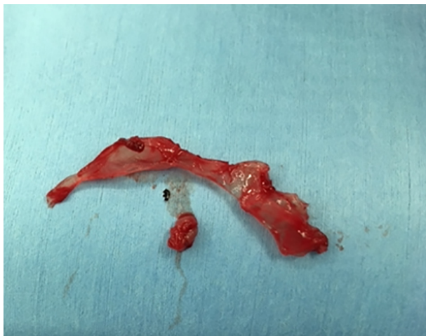
FIGURE 2. The fibrin mass removed from the left ventricular cavity. Fibrin glue used for hemostasis of the suture line after the left ventriculoplasty. The fibrin glue leaked into the left ventricular cavity as a floating mass.

Fibrin glue (FG) is widely used for hemostasis, and its usefulness has been reported. However, the routine use of FG and the necessary precautions to ensure safety need further examination. A systematic review and meta-analysis by Daud and Kaur 1 showed that the use of FG significantly reduced the blood loss and operative time. However, no significant differences in the postoperative blood transfusion volume, reoperation rate, or 30-day mortality were observed. Thus, the study suggested that FG should be used selectively rather than routinely in cardiovascular surgery. The use of FG in coronary artery bypass grafting can reportedly increase the 30-day mortality. 2 On the basis of these reports, the routine use of FG is not recommended.