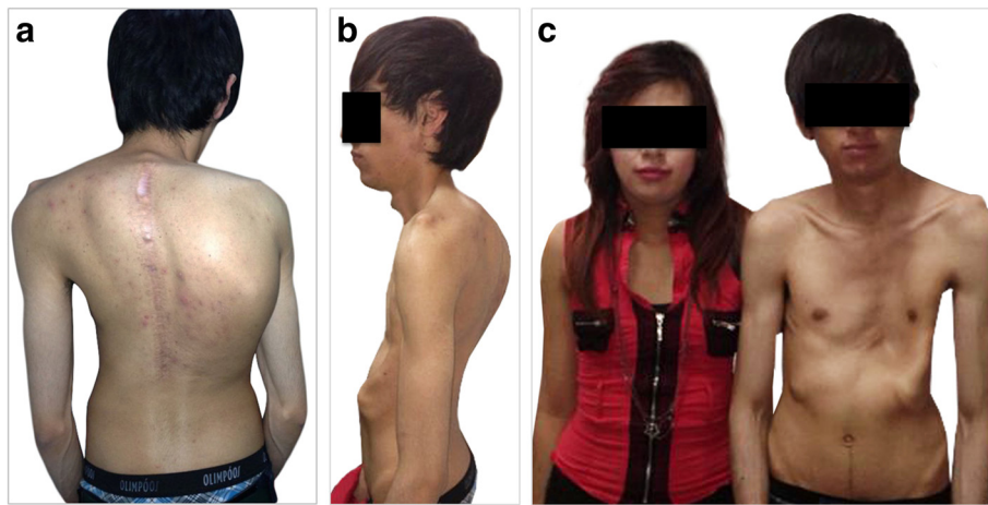
Fig. 1 Clinical features of the proband and his sister. a, b Clinical phenotype of the proband (II:2) including severe pectus excavatum, scoliosis and some Marfan facial features. c Clinical phenotypes of the proband and his sister (II:3) including facial features

points for the score in the revised Ghent Criteria10–11. We then evaluated the rest of the family members.