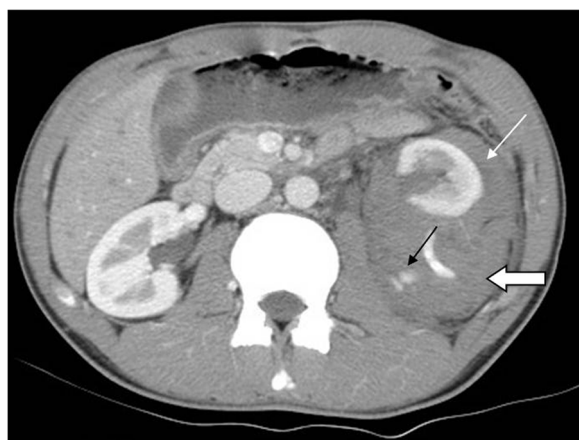
Fig. 1 This was a 15 year-old male with grade IV left renal injury from a motor accident. Contrast enhanced CT in arterial phase in axial section showed contrast medium extravasation (black arrow), perirenal hematoma (open arrow) and pararenal hematoma (white arrow)

Blood transfusion in 24 h was required in 11 patients (61 %) with the average amount of blood transfused being 3.0 \pm 3.0 units. Of these, three patients (75 %) were from the TAE group, and 8 (57 %) from the non-TAE group. No patients needed blood transfusion in the non-TAE group after 24 h, while two patients required blood transfusion following TAE or angiogram group after 24 h: one patient (number 3) required 4u blood transfusion because he underwent operation for epidural hemorrhage and intracranial hemorrhage, and another one (number 6) required 2u. Serum creatinine was normal ( <1.5 mg/dL) in all patients at the time it was measured in the emergency room. Hematuria was detected in three patients (75 %) in the TAE-group and 12 patients (86 %) in the non-TAE group.