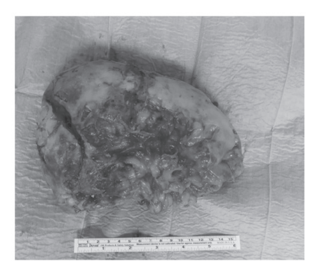
Figure 3. Macroscopic view of the resected giant myelolipoma.