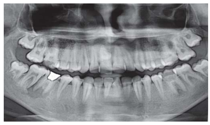
Fig. 1: The effect or coronal restoration and root canal filling can be further evaluated with the OPGs shown here. Due to inadequate root canal fillings and improper CR, a periapical lesion more than 3 mm is seen in relation to mandibular right molar