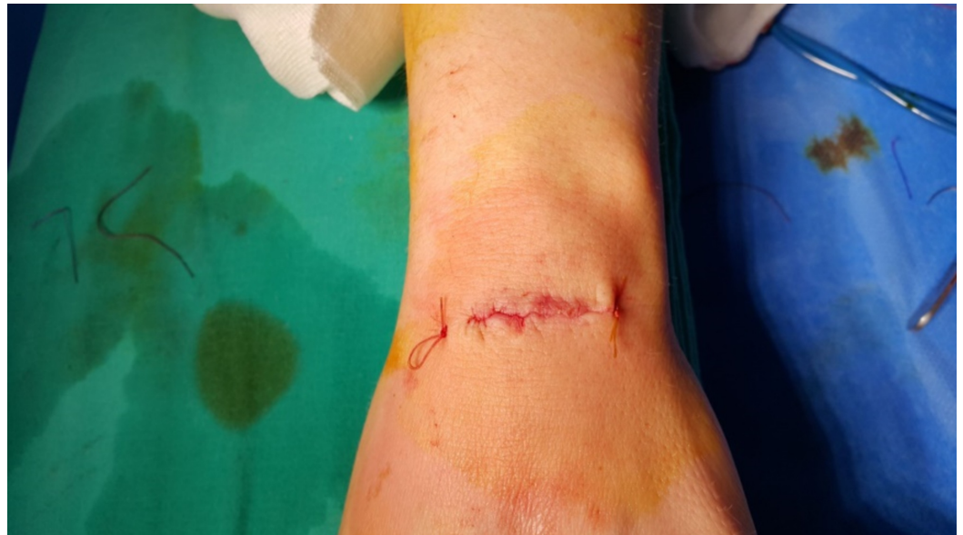
FIGURE 2: Transverse incision for dorsal carpal ganglionectomy.

cm transverse incision over the DCG (Figure 2). Since the DCGs are generally located between the extensor pollicis longus and extensor digitorum communis tendons, these two tendons are preserved, and the ganglion and pedicle are released (Figure 3A). Ganglion was dissected through SL ligament together with the adjacent joint capsule (Figure 3B). Ganglion, pedicle, and capsular extensions were excised off with a portion of the SL ligament (Figure 3C). Hemostasis was achieved by releasing the pneumatic tourniquet. We did not close the joint capsule in any patient since it caused limitation during wrist movements. In all cases, the skin incision was sutured subcutaneously. All patients were discharged on the day of the operation with a short arm splint. At the first control one week later, immobilization of the wrist was terminated. Strengthening movements were avoided for the first four to six weeks.