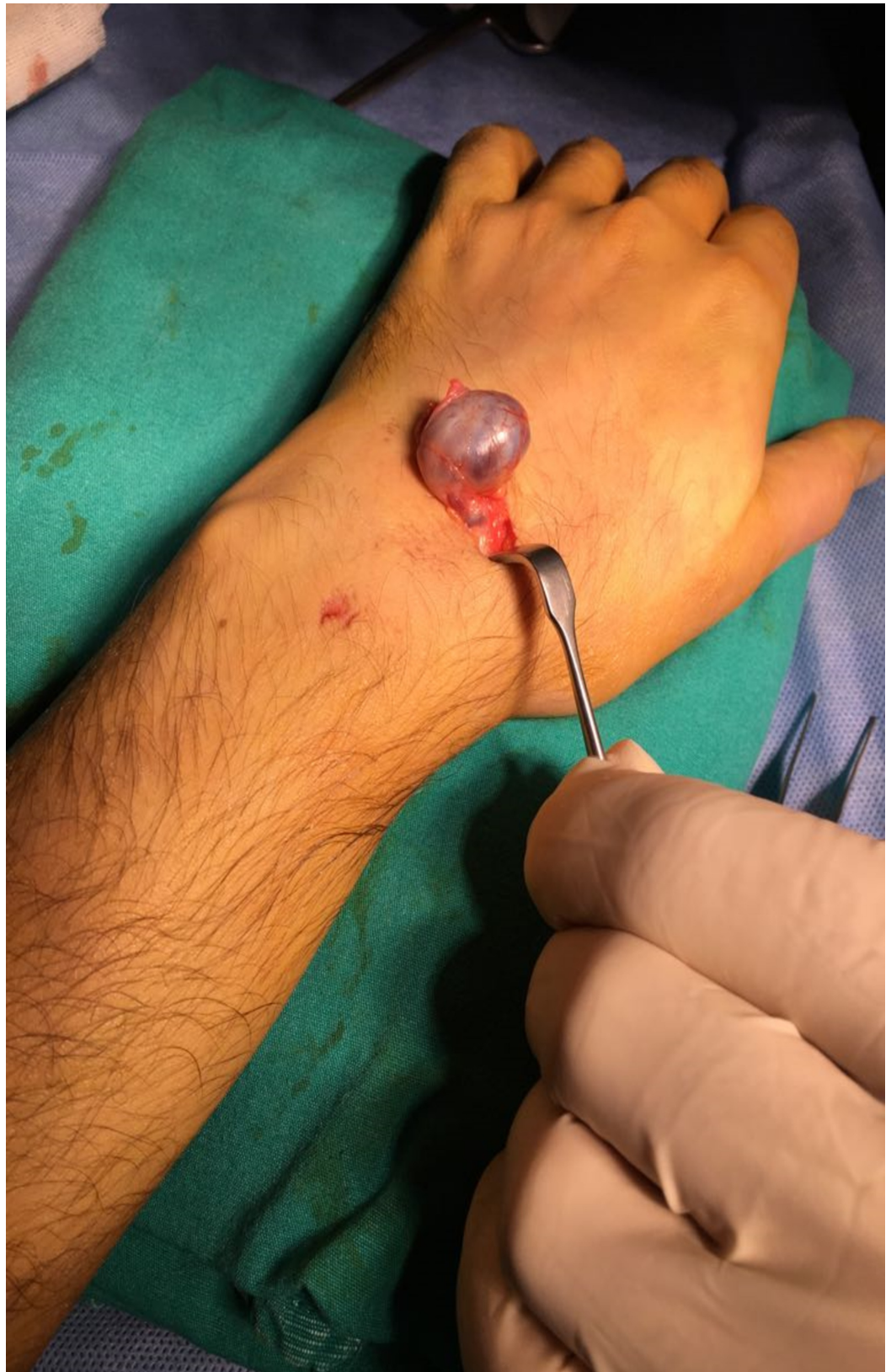
FIGURE 4: Intralesional hemorrhage in the ganglion.