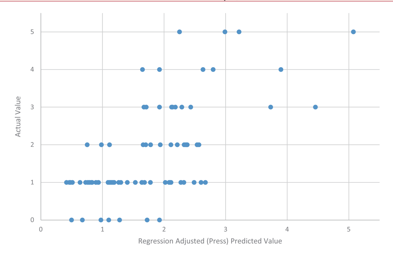
Fig. 2. Scatter plot of the actual and predicted FAC scores at discharge in the KAFO group.

contract the tibialis anterior. These patients had impaired light touch and position sense, poor balance function, and poor cognitive function. In contrast, patients using AFOs had mild hemiparesis, intact sensory function, and good balance function. However, more than half the patients using AFOs could not fully dorsiflex the ankle. Therefore, AFOs were required for dorsiflexion during the swing phase of gait. Nikamp et al. reported that ankle kinematics and spatiotemporal parameters improved with the use of AFOs.<sup>4)</sup> Our study showed the conventional indications for AFOs and KAFOs based on median SIAS motor scores and sensory scores. At present, there are no clear criteria for selecting AFOs or KAFOs. This study aimed to determine the characteristics of patients who were prescribed AFOs or KAFOs in the clinical setting. The scores and physical characteristics that were identified showed the current applicability of these orthoses. These findings may help in selection of the most appropriate orthosis for gait rehabilitation. Further research is required to confirm our results, but our study findings can inform the design of future studies.