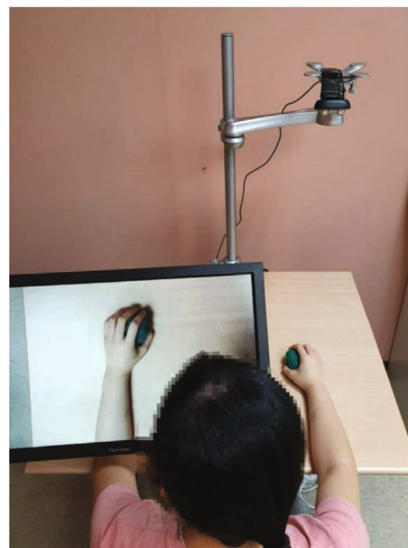
FIGURE 1: Demonstration of digital mirror therapy.

2.3.1. DMT. During DMT, the movements of the patient's nonaffected hand (e.g., right hand) were recorded, instantly transformed into mirror images of the affected hand's movements (e.g., left hand), and presented on the screen (Figure 1). The images of the nonaffected arm and hand were captured by the webcam, transformed by the software, and superimposed on the affected arm and hand. At the same time, the patients were required to imagine that the movements on the screen were performed by their affected arm and hand. For the AROM exercise period (15 min), the patients observed transformed AROM exercise on the screen, imagined it as the movements of the affected arm and hand, and simultaneously moved the affected arm and hand as much as possible. The AROM exercises included elbow, forearm, wrist, and finger movements. For the reaching movement or object manipulation period (20 min), based on each patient's level of motor function, the patients were asked to perform one to two reaching movements/