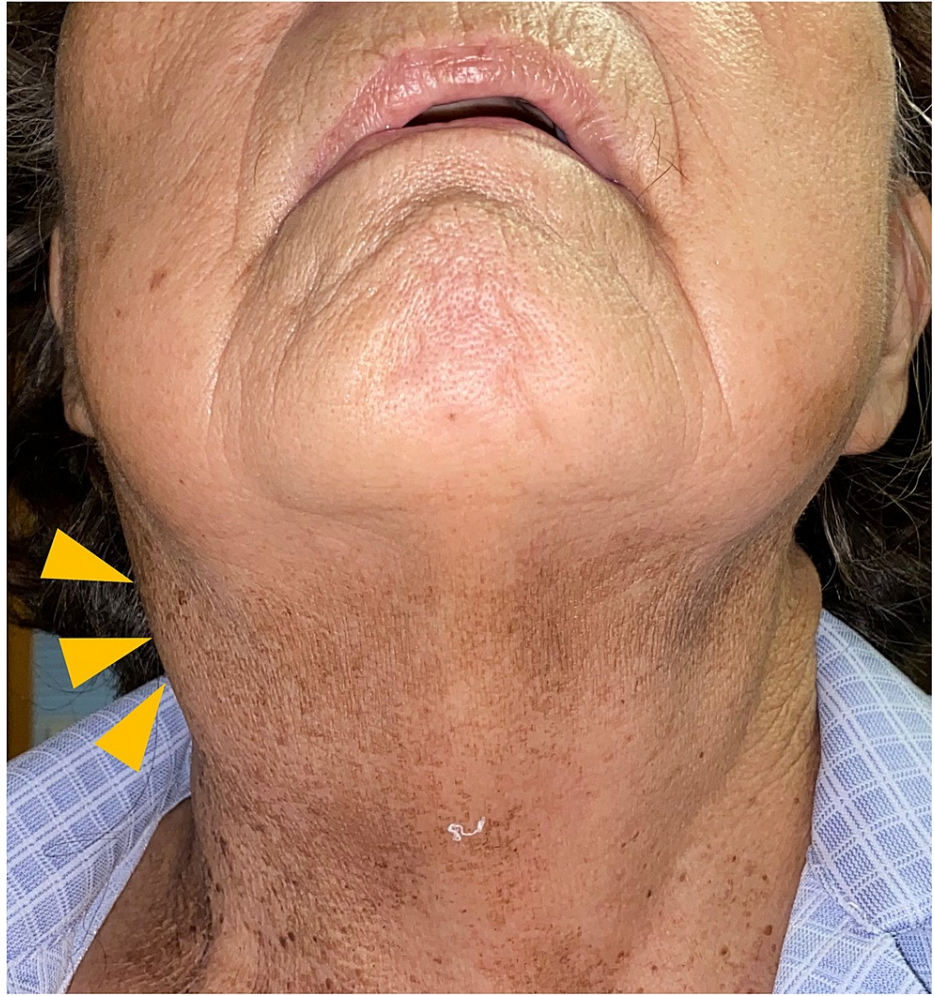
FIGURE 1: Right cervical swelling was observed, and pain was present in the same area (arrows).