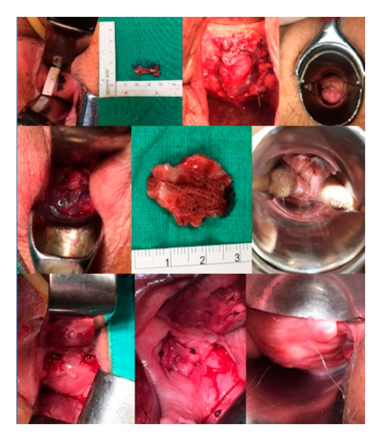
Figure 2. Amniotic graft inlay and wound healing of the patients.

None of the patients had complications during the operation and the average surgical time was 32 minutes (range: 25–45 minutes). Four patients complained of temporary vaginal discharge after surgery. Before surgery, five patients were sexually active and two patients complained of dyspareunia; however, none of the patients complained of dyspareunia after the surgery. No immunosuppressants were given and no immune graft rejection was encountered. All had good functional recovery. Moreover, none of the patients had recurrent prolapse, stress incontinence, wound infection, or pelvic pain.