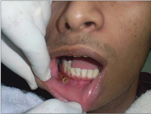
Figure 4: Intraoral opening of the inserted tube along the labial vestibule

of approach is dictated by the level of fracture and surgeon's preference. [4]