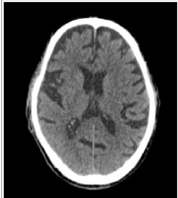
Figure 2. CT scan of the head showing a normal scan with cerebral atrophy.

An urgent computed tomography (CT) scan of the head was done which revealed a normal scan with cerebral atrophy (Figure 2).