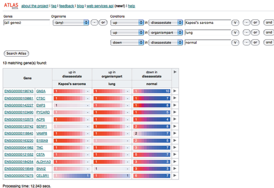
Figure 3. ArrayExpress Atlas advanced query interface showing all genes up-regulated in Kaposi's sarcoma diseased lung tissue and down-regulated in normal samples.

cell (Figure 3). More complex queries combining several conditions are available via the advanced Atlas interface.