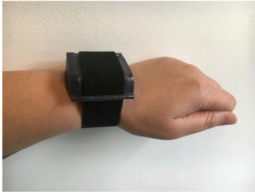
FIGURE 1 | Appearance of the T'ena IMU sensor-based system and approximate mounted position.

enabled. Together, these firmware changes allowed for higher efficiency and timing precision with processing and transmission of bulk measurements. Given the considerable hardware and firmware changes, it is essential that the sensor system undergoes the revalidation process prior to clinical validation and product commercialization. As such, the aim of the present study was to determine the ability of the redesigned IMU sensor-based system (hereafter referred to as the T'ena sensor) to reliably and accurately assess movement quality and efficiency in physically and neurologically healthy adults. Upper limb movement kinematics measured by the T'ena sensor were compared to the gold standard criterion measure during three functional tasks.