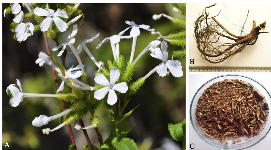
Figure 1 Plumbago zeylanica (A) Habit; (B) Dried root; (C) Powdered root.

The animals were grouped into four different categories as mentioned below.