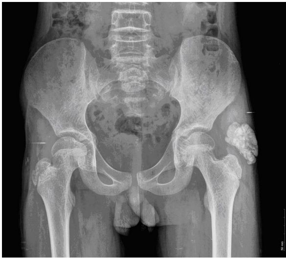
Figure 1 A 14-year-old boy with a multilobular, calcific mass around his left hip joint.