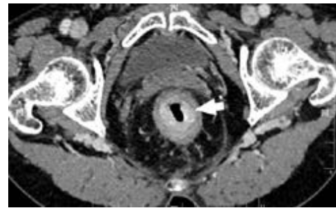
Figure 7 Computed tomography scan of 59-year-old woman with signet-ring cell carcinoma of the rectum.

Notes: Computed tomography scan shows large mass with heterogeneous enhancement. Hypoattenuated area is greater than two thirds of tumor, and enhancement in solid portion of tumor is less than that of normal bowel wall (arrow).