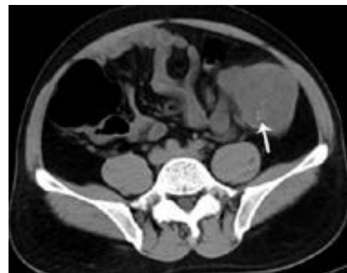
Figure 8 Computed tomography scan of 44-year-old man with mucinous carcinoma in descending colon.

In accordance with the majority of published literature reports, 7,20 MAC showed the presence of CT signs, such as bowel-wall thickness >2 cm, long segmental and eccentric bowel-wall thickening, heterogeneous enhancement of the lesion with poor enhancement of the solid portion, a large area of hypoattenuation, and intratumoral calcification, which indicated the high likelihood of the MAC. However, in our study, there was no difference in the thickening, involved long segmental bowel wall, and pericolic fat infiltration between MAC and SC ( P=0.555 , P=0.249 , P=0.542 ), but MAC and SC appeared more severe than AC ( P<0.01 ). This might be associated with the pathological grading of MAC and SC. Because both MAC and SC were classified