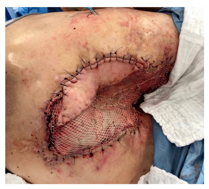
Fig. 5 Intraoperative view with free latissimus dorsi myocutaneous flap inserted to reconstruct the perineal defect, the muscular part of the flap was covered with split-thickness skin grafts

After reconstructive surgery, the patient was transferred to the Intensive Care Unit (ICU) and consequently placed in a lateral decubitus position. Mobilization was commenced 7 days after free flap transfer. During the course of the subsequent treatment, the patient developed acute cardiac decompensation (LVEF of < 10%) and consequently acute liver failure, which significantly prolonged the inpatient stay. After stabilization and treatment of cardiac failure, LVEF and liver function gradually recovered. The patient was equipped with a LifeVest® and discharged 69 days after his last surgical procedure (Fig. 6).