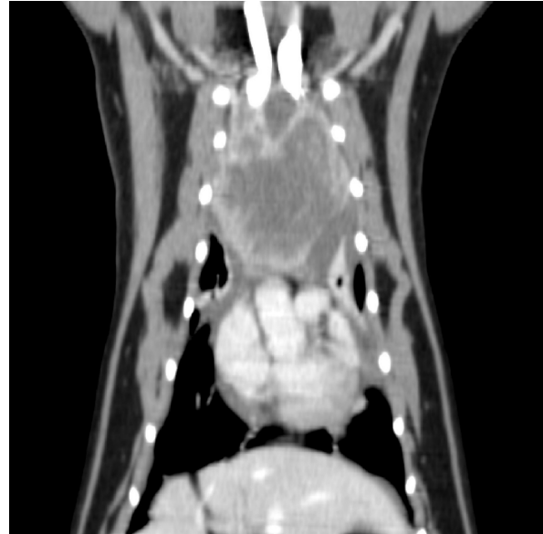
Fig. 2. Computerized tomography of the cranial mediastinal mass (coronal plane).

The cranial mediastinal mass was approached through a cranial median sternotomy extending caudally from the manubrium. The xiphoid was left intact. Upon entry, there was a moderate amount of serosanguinous fluid.