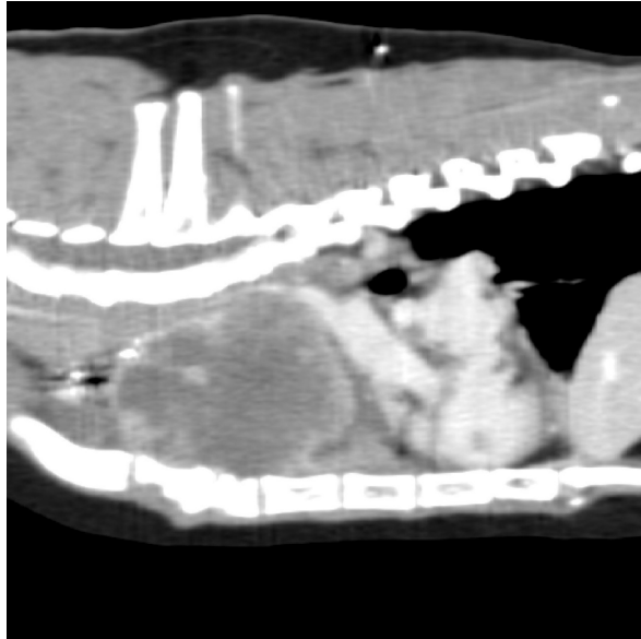
Fig. 1. Computerized tomography of the cranial mediastinal mass (sagittal plane).

invasion. There was no evidence of subcutaneous edema of the head or cervical region. Moderate volume of pleural fluid was bilaterally present. Multifocal, slightly branching soft tissue conglomerates largely following the bronchi of the caudal lobes toward the apex was noted, most likely to be bronchial disease with bronchiolar consolidation. Pulmonary metastatic neoplasia was considered to be unlikely. Surgical resection in the form of debulking was recommended on the basis that the large cranial mediastinal mass was most likely the cause of the cat's clinical signs, and that reduction of gross disease should improve survival time as well as being more responsive to adjunctive treatment with chemotherapy. The cat was then started on mirtazapine (1.875 mg orally every 48 hours) and prednisolone (5 mg orally every 24 hours).