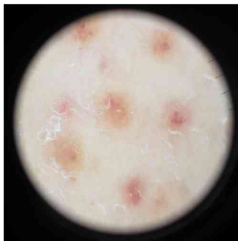
Figure 2 Dermatoscopy of the lesions showed red-brown spots and globules arranged on a background of coppery-red pigmentation.

Skin biopsy showed a thinned epidermis, lichenoid infiltrate in bands with lymphocytes in the papillary and reticular dermis (Fig. 3A), small non-necrotizing granulomas in the dermis formed by deposits of epithelioid cells and multinucleated giant cells, surrounded by lymphoplasmacytic cells, without necrosis (Fig. 3B). Erythrocyte extravasation and a few eosinophils were observed, with the absence of vasculitis. Hemosiderin deposits were demonstrated using Prussian blue iron stain (Fig. 3C). Periodic acid–Schiff (PAS) and Ziehl–Neelsen staining were negative.