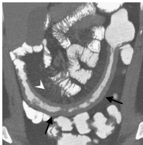
Fig. 1 A 38-year-old with Crohn's disease. There is mural thickening of the ileum (black arrows), increased mesenteric fat attenuation and prominence of the vasa recta (white arrowhead), all in keeping with active disease superimposed on previously documented chronic thickening of the ileum

Abdominal hernias are evaluated using MBCT, especially with provocation techniques such as Valsalva manoeuvres, to enhance visualisation of the area of herniation.