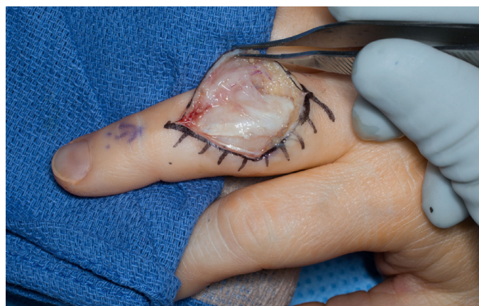
Fig. 2. Intraoperative findings during irrigation and debridement included edema around the third proximal interphalangeal joint suggestive of effusion or synovial thickening.

clarithromycin, doxycycline, trimethoprim-sulfamethoxazole, ciprofloxacin, amikacin, minocycline, and linezolid. She was therefore initiated on clarithromycin 500 mg twice a day and minocycline 100 mg twice a day for a planned duration of three to six months. She experienced significant improvement on this antibiotic regimen. As she had partially improved at the three-month time point, the decision was made to extend the treatment course for another three months. At the time of this report, she completed five months of therapy and improved significantly without any adverse drug events.