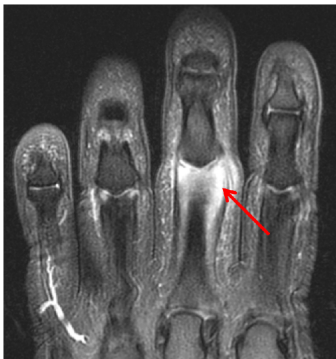
Fig. 1. Coronal T2 magnetic resonance imaging (MRI) of the palmar aspect of the right hand illustrates an edematous third proximal interphalangeal joint with mild enhancement (red arrow) after contrast administration, suggesting synovitis.