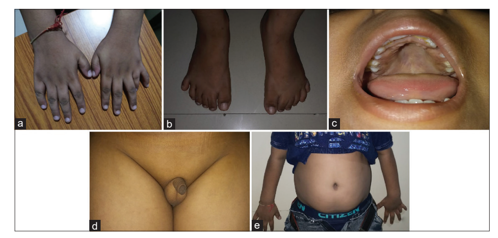
Figure 2: Postaxial polydactyly in the left hand (a) and in the bilateral feet (b), high-arched palate (c), syndactyly of the second and third toe, micropenis (d), and truncal obesity (e)

BBS is genetically heterogeneous with 6 loci mapped till date. The most common gene is BBS1 located at chromosome 11.<sup>[2]</sup> Retinal dystrophy is the most important clinical feature of the disorder. BBS has previously been described as a rod-cone, cone-rod,