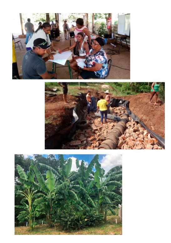
Figure 4. Monitoring & control: decision-making process, implementation of the chosen alternative and 18 months after construction. Consent for publishing these photos was obtained.

To guarantee monitoring and control measure stages and to verify performance, our research group visited every 6 months (Figure 4) to observe the installed system. This confirmed that the community was fulfilling their role with generated effluent for evapotranspiration, that is, with zero discharge. In addition, it was possible to evaluate a better integration of the landscape with the chosen ecological alternatives, allowing a better harmonic environment, providing better tourism conditions in the region and banana production for consumption. The new system also avoids open sewage, which pollutes soil, groundwater, and surface water.