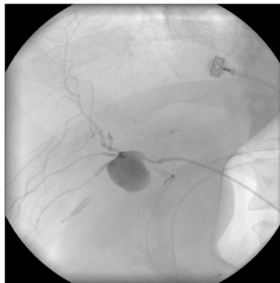
Figure 1 Pseudoaneurysm of the right hepatic artery on angiogram.

Two days following this discharge, the patient had an episode of haematochezia associated with collapse at home. He was taken to the emergency department of our hospital where he was hypotensive (blood pressure 92/63 mmHg) and tachycardic (heart rate 115 beats/min). His abdomen was soft and non-tender, and digital rectal examination revealed dark red blood. His haemoglobin level was 111 g/L. He was initially resuscitated with crystalloids, but had further episodes of fresh rectal bleeding. Repeat haemoglobin was 58 g/L, and packed red blood cell transfusion was commenced. Urgent selective computed tomography angiography was performed revealing a 2 × 2 centimetre aneurysm arising from the RHA/cystic artery adjacent to surgical clips. The aneurysm was embolised with platinum and stainless steel radiological coils (Figure 1, Figure 2). A tubogram through the biliary stents after the procedure showed no evidence of leakage or stricture of the biliary anastomoses. He had no further bleeding and was discharged three days later. Four weeks later, the stents were removed in the outpatient rooms.