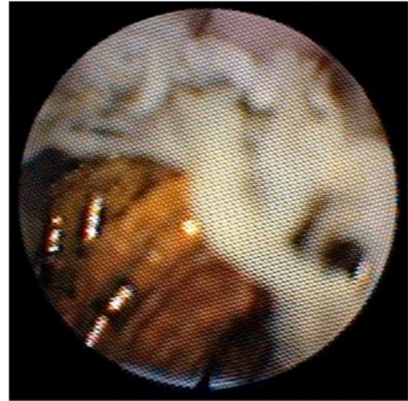
Figure 4 Coils seen around hepaticojejunostomy from within Roux limb on cholechoscopy.

Thus, approximately 10 months after his BD reconstruction, he was admitted electively for percutaneous transhepatic cholangiography (PTC) and balloon dilatation of this bilio-enteric anastomosis. After confirmation of the stricture by PTC, a 4 French catheter was inserted into his left ductal system and an 8.5 French pigtail catheter was placed into his right ductal system but neither could be advanced into the enteric limb (Figure 3). Two further attempts were made at PTC balloon dilatation, but both failed. It was decided to attempt to visualise the anastomosis through the Terblanche access limb. Cholechoscopy through the modified Terblanche access limb showed multiple radiological coils from the previous embolisation of the RHA pseudoaneurysm at the site of the anastomoses, causing a mechanical obstruction (Figure 4, Figure 5). Laparotomy was performed