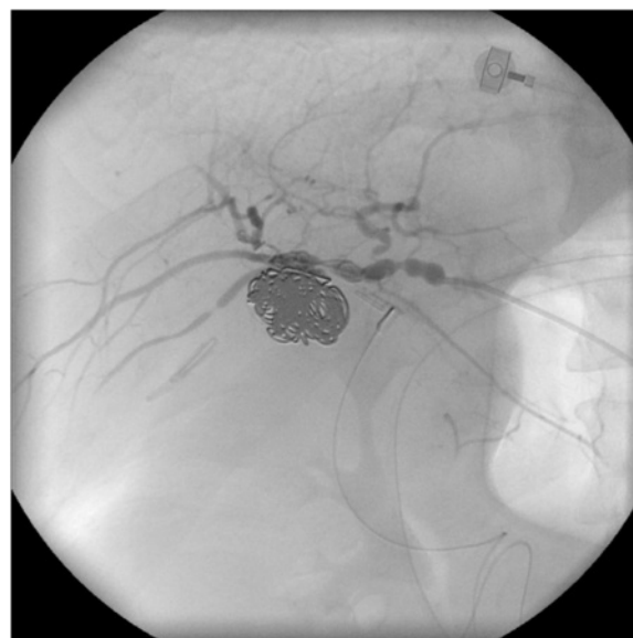
Figure 2 Coil embolisation of right hepatic arterial pseudoaneurysm.

A magnetic resonance cholangiopancreatography (MRCP) was performed, showing slight prominence of the intrahepatic biliary radicles above the level of the right and left main hepatic ducts, with preservation of