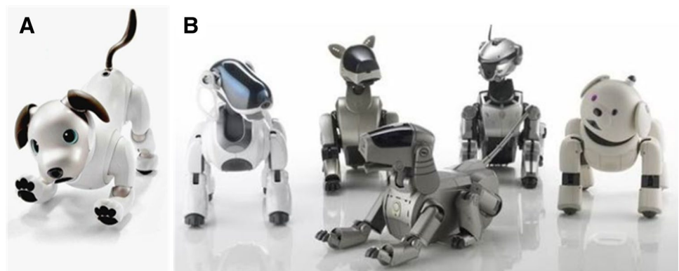
Fig. 2 Sony AIBO. Fourth (current) generation (a) and first to third generations (b) (adjusted from Kertész and Turunen 2019)

Assuming that autonomous social robots will inhabit human beings' daily living space as attached heterospecifics in the