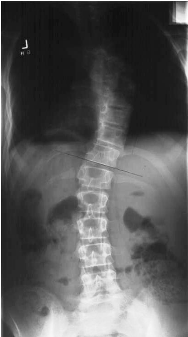
Figure 1 PA plain radiograph Turner syndrome scoliosis.