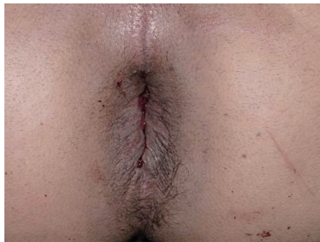
Fig. 6. Outcome following the surgery.

known complication of abdominal rectopexy; however, a concomitant sigmoid resection may decrease the constipation rate [10, 11]. Bruch et al. [12] also suggested that preservation of the “lateral ligaments” might improve the postoperative constipation. In addition to the general hazards of laparotomies, these procedures involve the risk of pelvic nerve damage, which may cause sexual dysfunction in men, and adhesion formation, which may affect fertility in women. In one study, retrograde ejaculation and impotence were seen in 17.2% of the patients and were major causes of dissatisfaction after posterior rectopexy [3]. Perineal procedures have been suggested as initial options in certain groups of patients: young men in whom pelvic dissection and associated risk of injury to the pelvic nerves may hazard sexual dysfunction [13, 14], young nulliparous women in whom potential injury to the ovaries