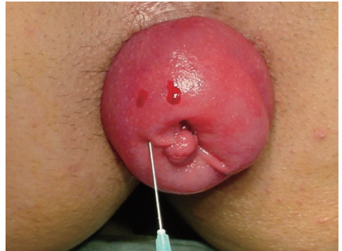
Fig. 2. Injection of epinephrine solution (1:100,000) into the submucosa in patients with a full-thickness rectal prolapsed.

niques used to repair rectal prolapse are generally categorized into perineal or abdominal approaches. Abdominal procedures mainly involve fixation of the rectum to the sacrum with or without resection of the rectum or the sigmoid colon. The method used for rectopexy may vary in different procedures. Constipation is a