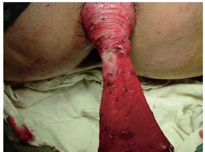
Fig. 3. Mucosal layer dissected from the muscular layer.