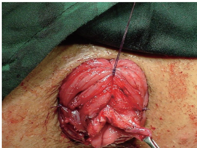
Fig. 4. Insertion of plicating sutures in the muscular wall of the rectum after dissection of the mucosa from the muscularis layer.