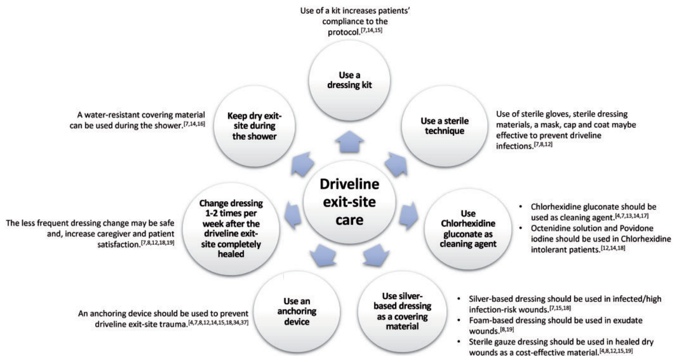
Figure 2: Recommendations based on the systematic review.

implantation. An anchoring device should be used to prevent driveline exit-site trauma. The driveline exit site should be kept as dry as reasonably possible. The dressing change frequency can be based on the properties of the exit site. For a dry exit site that has completed the healing process, the dressing change frequency can be once or twice a week. The proposed changes, despite the increased cost for materials and agents (e.g. silver-based dressings), may significantly reduce frequent readmissions and long hospitalizations.