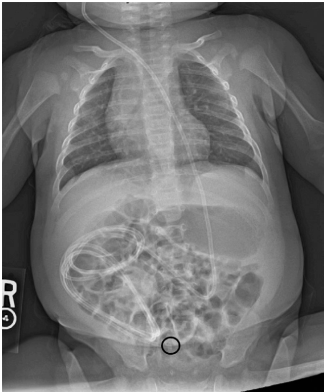
FIG. 1. Case 1: Abdominal radiograph showing tip (circle) at the approximate entrance to the umbilical hernia.